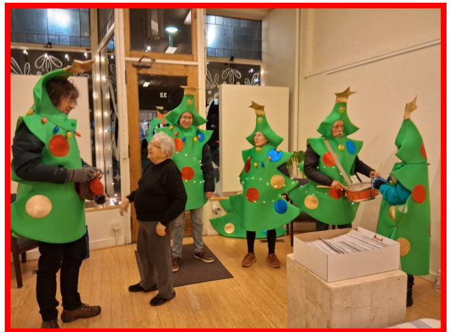
Success — at last!