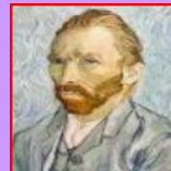
Vincent Van Gogh

Purple is the soul's color, vibrant yet calm, passionate yet serene.