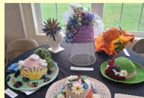
So many creative hats!