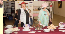
Enjoying a relaxed, fun afternoon!