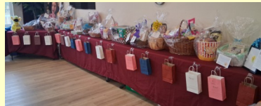
So many raffle baskets!