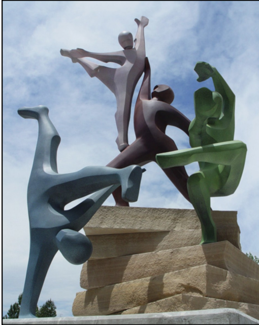
"Dancing on the Stairs"

Do you have a "dream project" that you'd like to create? I would like to have a show that features an installation of 2d and 3d works exploring my journey through loss and change. It is a current body of work. I would also love to create an illustrated book or interactive animated book.