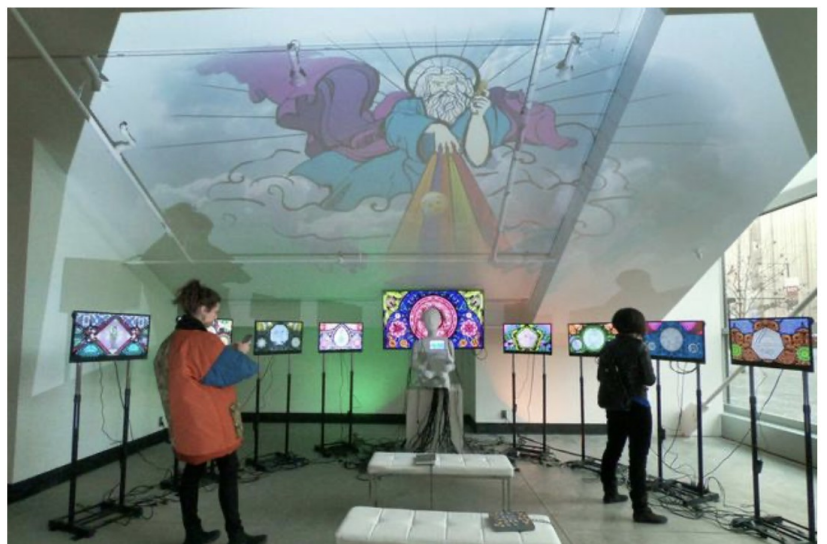
"The Little Chapel of Our Holy Motherboard" at The Understudy in Denver, CO 2018

I am very proud of my public art works, whether it is the large bronze sculptures or my digital projected pieces. Being in public collections means many people get to enjoy them. I am also very proud of a large digital installation I did called "The Little Chapel of Our Holy Motherboard". It was an ambitious work that turned out really well and I was able to install/show the piece in Santa Fe and Denver.