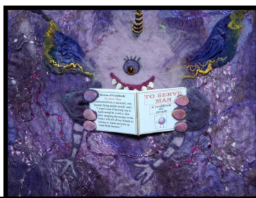
One-Eyed, One-Horned, Flying Purple People Eater Tina Blackwood