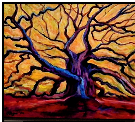
Purple-Yellow Tangled Tango Tina Beyea