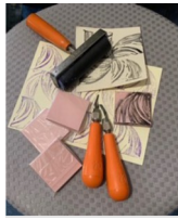
rubber stamp making